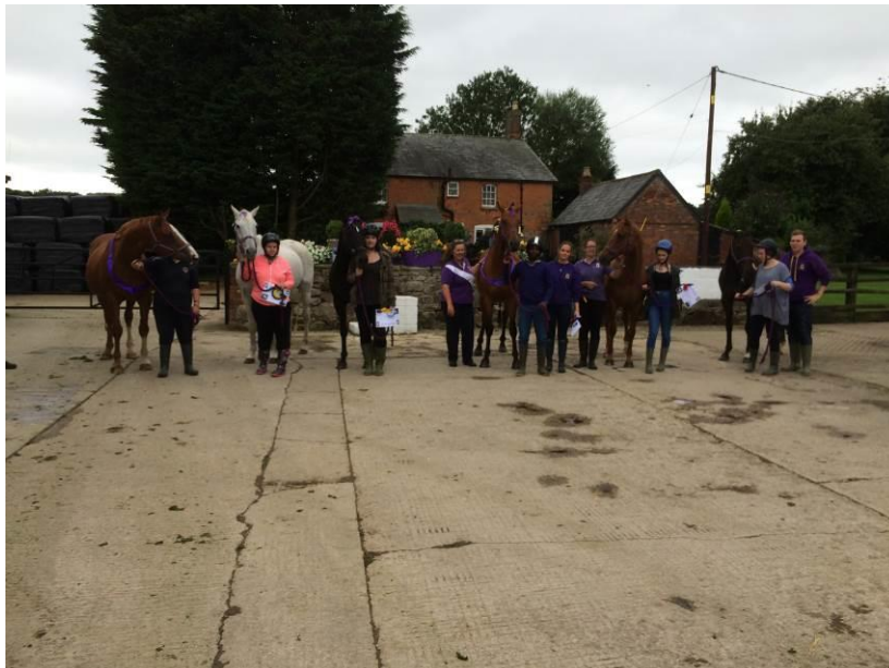
Greatwood students showcase their skills with former racehorses, Framed, Quixotry, Ouzbeck, Malapropism, Albuhera and Seek The Faith